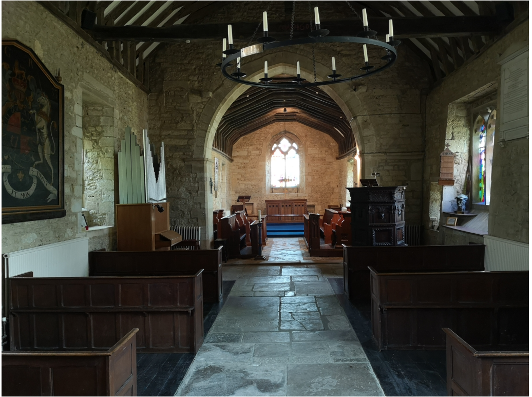
St Mary's Longcot