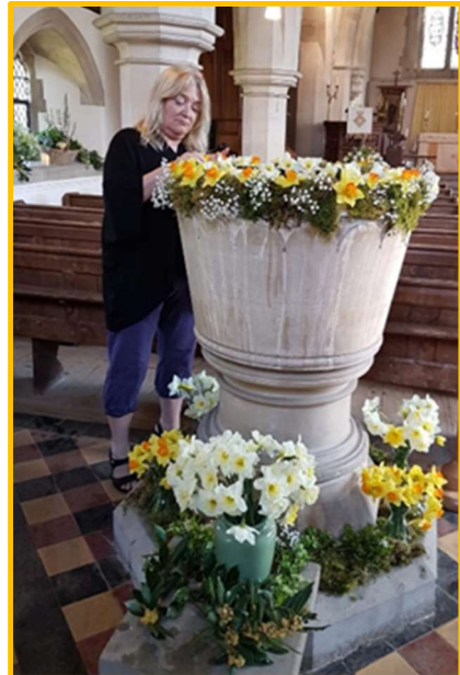
Decorating the font for Easter last year St Thomas' Watchfield