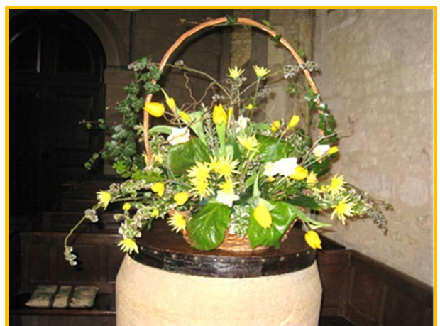
This beautiful Easter basket graced the font at St Mary's Longcot a few years ago